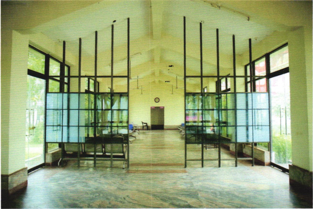
Security and basic amenities in the common room